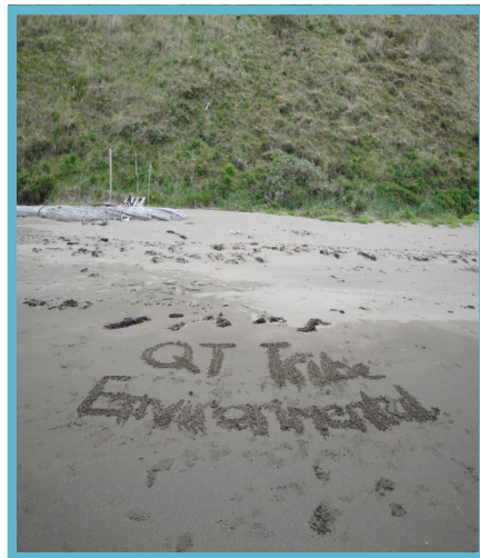
SAND DOLLAR BEACH Summer 2009

Halloween Carnival October 31, 2009 Noon-4:00pm