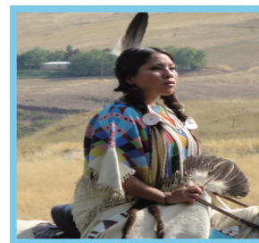
Members of the Nez Perce Tribe rode on there horses to the welcoming Luncheon.