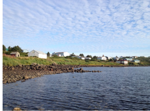
Beach in Sand Point