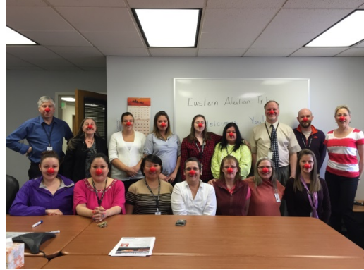
Red Nose Day in Anchorage Office May 21, 2015