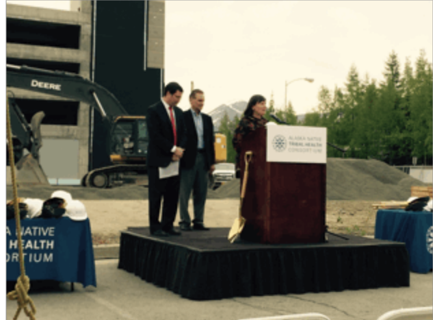
Groundbreaking of Patient Housing next to ANMC May 2015