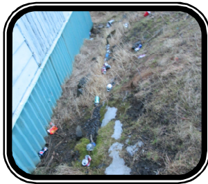
Trash around our community!

Litter can affect our community in many ways. It is something that can harm our wildlife and make our community look like a garbage dump. A lot of litter can be recycled. While taking a drive, you can find litter such as pop cans, plastic bottles, aluminum food bags, plastic store and garbage bags, and wrappers from different things. Many of these objects are recyclable! When garbage is on the ground, our community, looks like a dirty place. If we could keep our community clean, we would have a beautiful and healthier place to live. Let's make our community something we can be proud of.