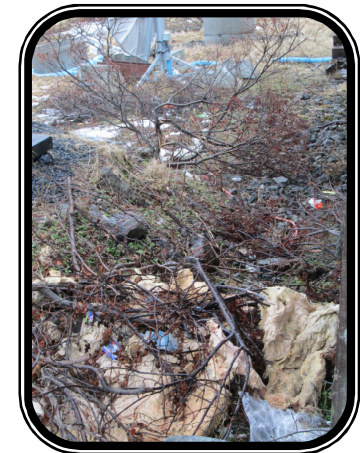
Trash around our community!

Wildlife are curious and can mistake litter for something else. When you are out and about and see some litter on the ground, please pick it up. Whether you have a garbage bag in your car, or in your pocket, please pick up any litter seen on the ground to make sure we are making our community a nice place to live in. It will also make our environment safe for wildlife. We want to make this a community for our future generations to be proud of.